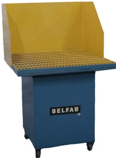
3636DTM (with grill option)