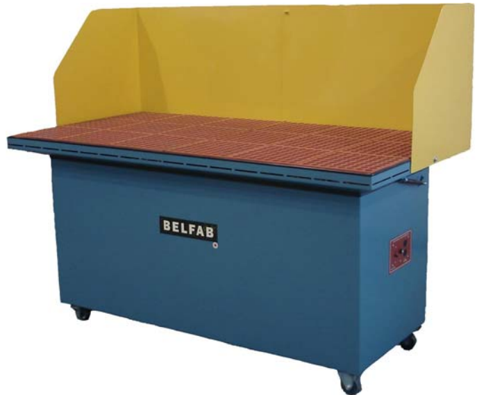
3672DTS (with matt option)